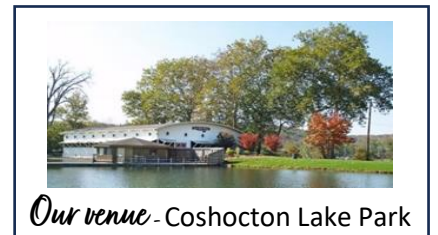
Our venue - Coshocton Lake Park

For more information, please visit www.riverRendezvous.com